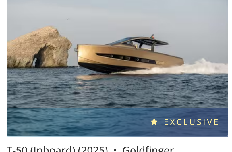
T-50 (Inboard) (2025) • Goldfinger Port de Mallorca, Mallorca Experience the epitome of luxury, performance, and