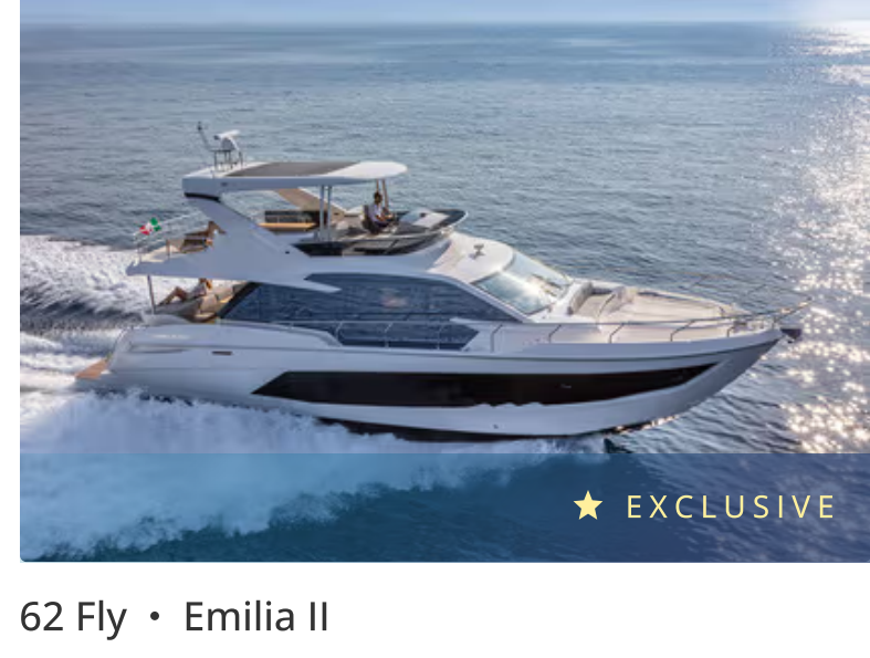
Port de Mallorca, Mallorca The perfect fusion between comfort, functionality, and beauty shapes a model that is synonymous with pure... From €4,700 Per Day