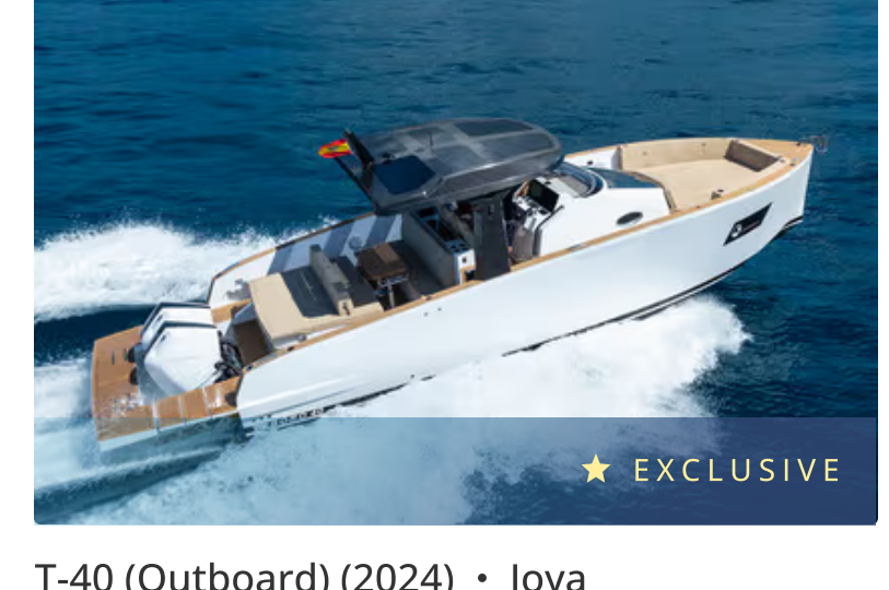
T-40 (Outboard) (2024) • Joya Puerto Portals, Mallorca

Crafted with precision and passion prepare to set sail on a