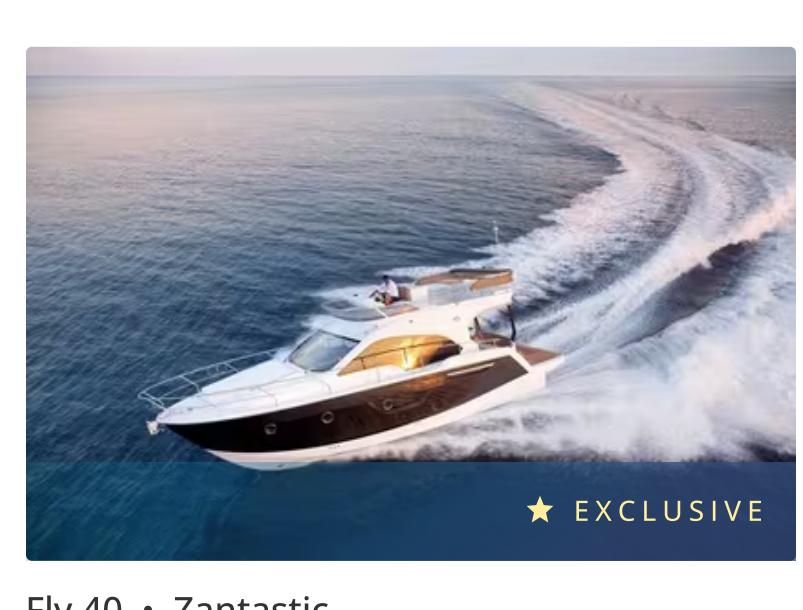
Fly 40 • Zantastic Club Náutico Porto Cristo, Mallorca Our Sessa Fly 40 Zantastic is the perfect day cruiser for small groups. Thanks to the two 350 HP engines, the mot... From €1,600 Per Day