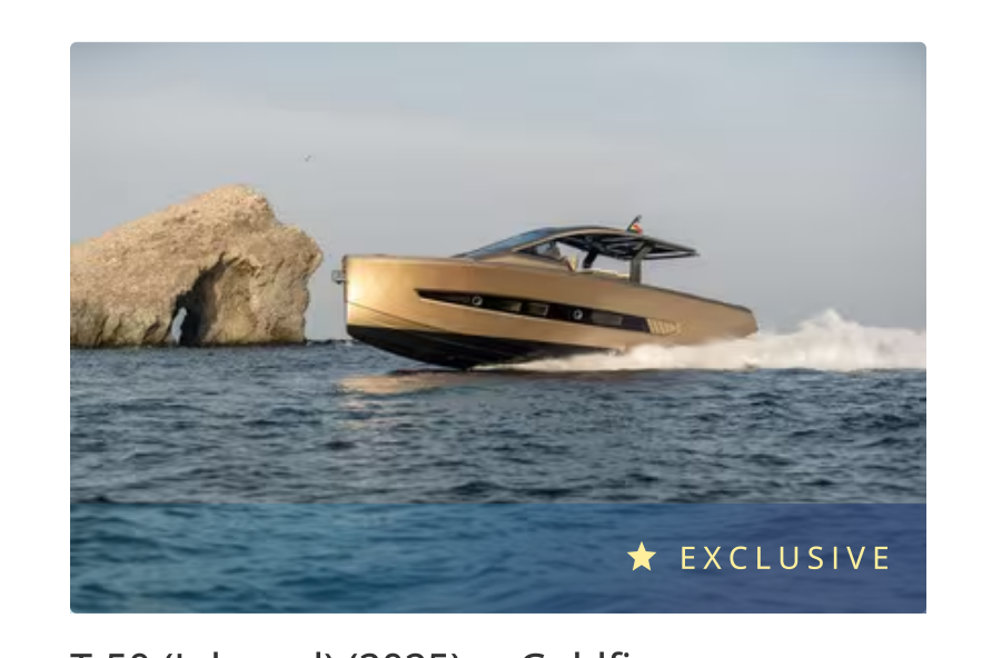
T-50 (Inboard) (2025) • Goldfinger Port de Mallorca, Mallorca Experience the epitome of luxury, performance, and cutting-edge design with Goldfinger, a Tesoro 50 Yacht. A...

space with essence, leathers, and fabrics worthy of the best artisan tradition.