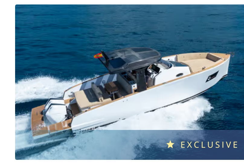
T-40 (Outboard) (2024) • Joya Puerto Portals, Mallorca Crafted with precision and passion prepare to set sail on a