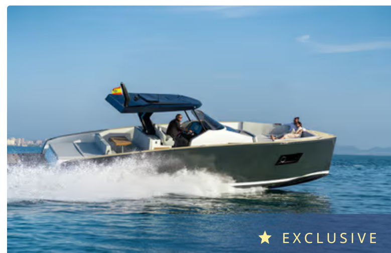
Tesoro T-40 (Inboard) (2024)