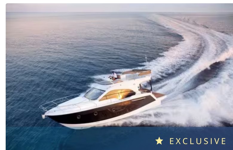
Sessa 40 Fly (2013)