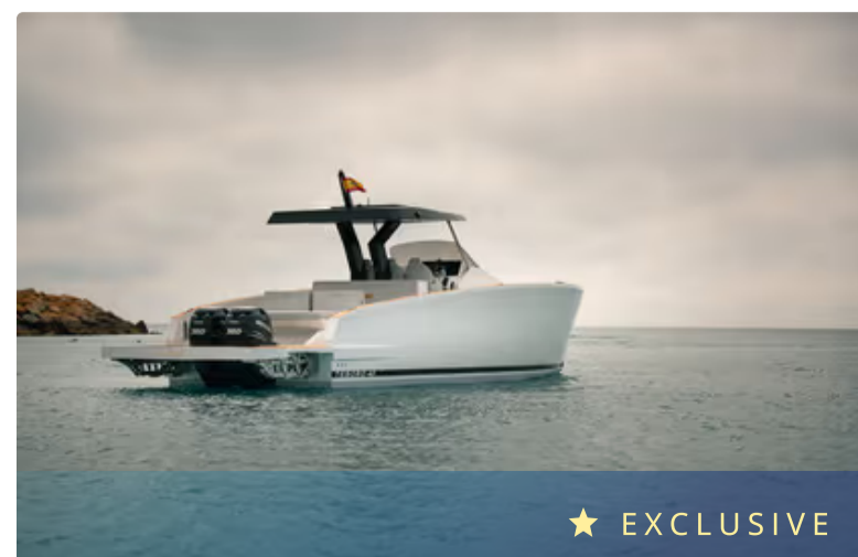
Tesoro T-40 (Outboard) (Available Now)