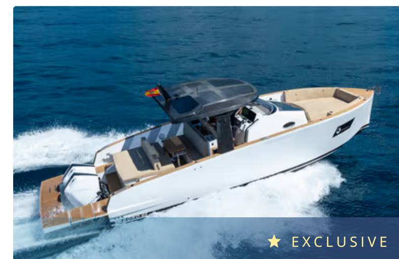
Tesoro T-40 (Outboard) (2024)