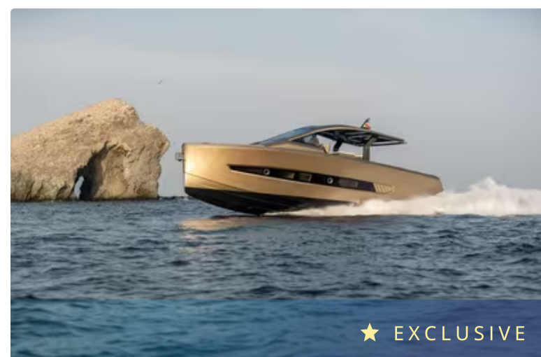
Tesoro T-50 (Inboard) (2025)