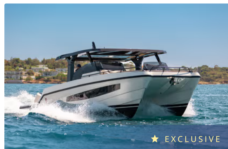
Tesoro T-38 Power Cat (2025)